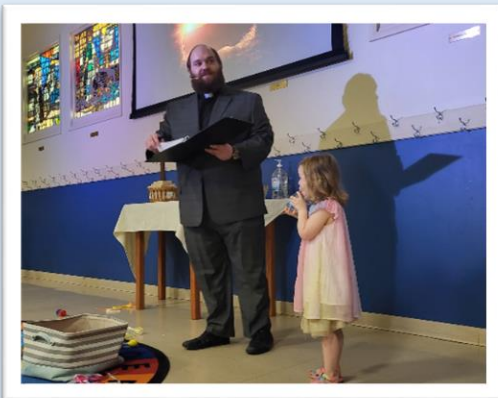
Connect Worship Services