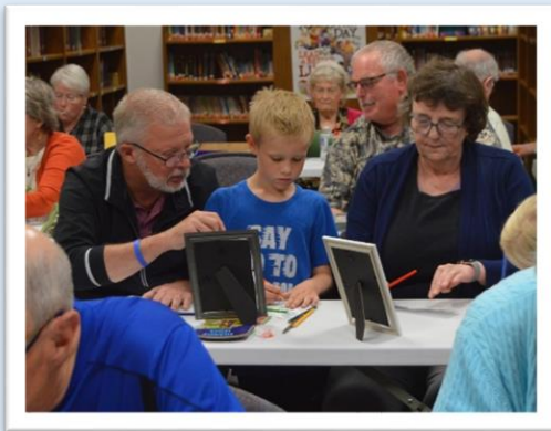
Wednesday Bible Study