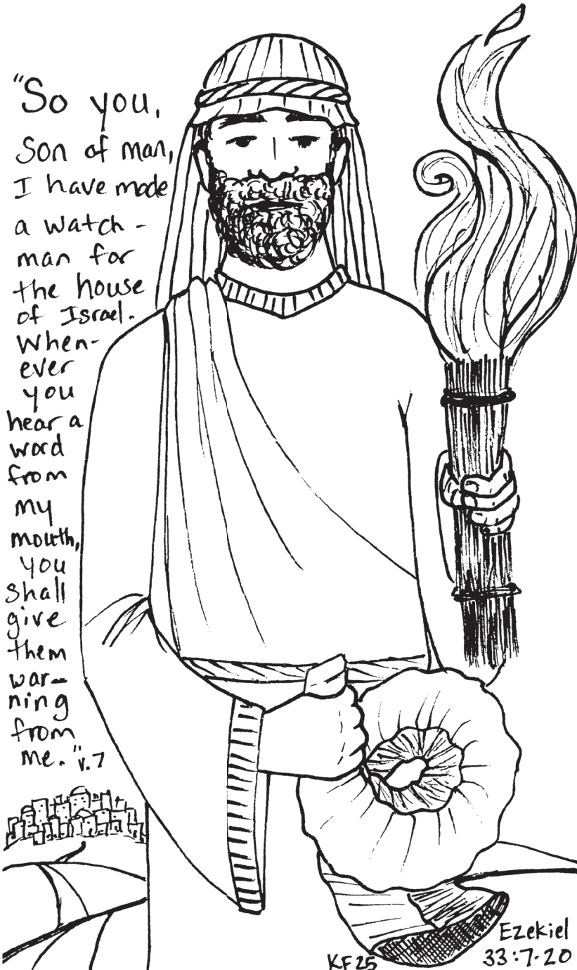
KF25 Ezekiel 33:7-20